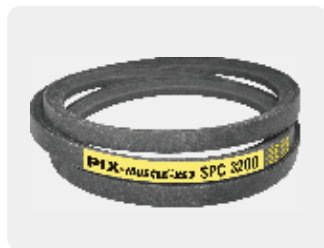
PIX-Muscle®-XS3 Belts High power, maintenance-free Belts in Wrap Construction