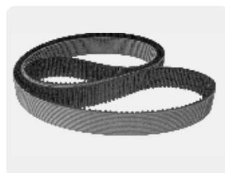
PIX-Brawn®-XT Belts Hybrid Belts for flour and rice mills