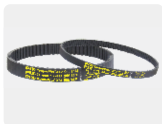
PIX-TorquePlus®-XT2 Belts High power Timing Belts