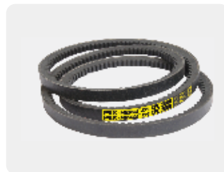
PIX-Muscle®-XR3 Belts High power, maintenance-free Belts in Raw Edge Cogged Construction